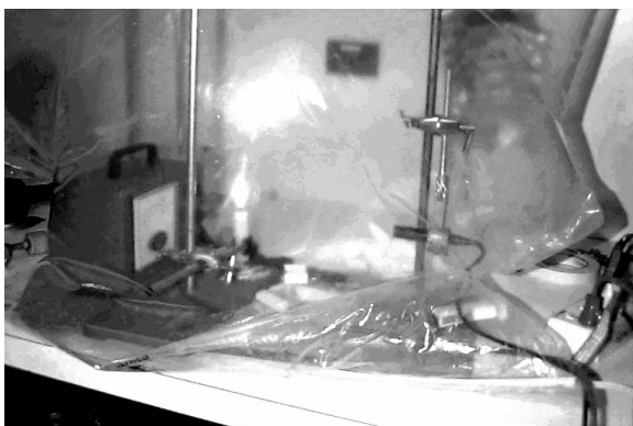
Plate 2. Close-up of experiment. Note, mini video camera centre right.