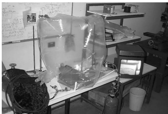
Plate 3. Overall view of experimental setup. Video recorder and argon gas bottle.