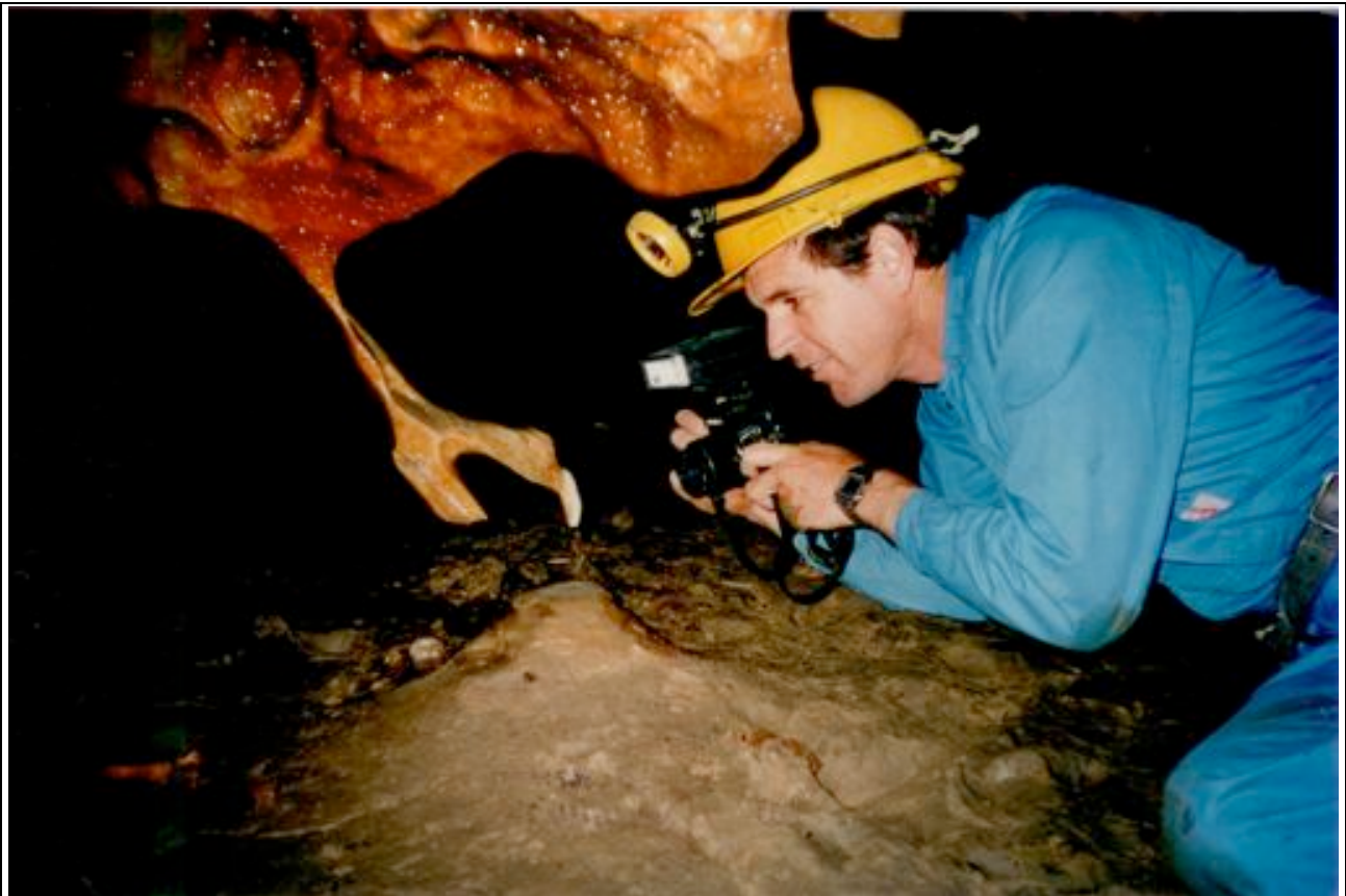
Garry Smith photographs a formation called 'The Claw' in a cave at Codrington Victoria.

Beside bats there are many other varieties of unique fauna which live their total life in the cave environment. In total darkness, such creatures as, cave crickets (Wetas), spiders, beetles, fish and crustaceans can be found. Even the undisturbed cave floor is teeming with microscopic life, so cavers should stick to a single path to avoid compacting all of the floor area and destroying the ecology of the cave. A study of this fascinating microscopic world will shed a whole new light on your understanding, of preserving the total cave ecology. Next time your underground have a close look at a small heap of bat guano with a large magnifying glass. A thimble full sample observed under a microscope will reveal more varieties of creatures then you ever imagined.