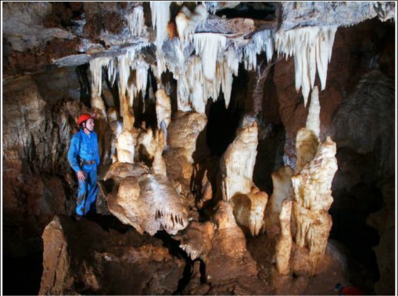
Garry K. Smith in the well decorated Clown Room of Main Cave.

Caving adventures subject people to a variety of circumstances from adrenalin pumping situations through to peaceful times resting in an awe inspiring chamber. Caving is both a sport and a science. The sporting aspect must be developed before the science can be truly pursued. To fully appreciate